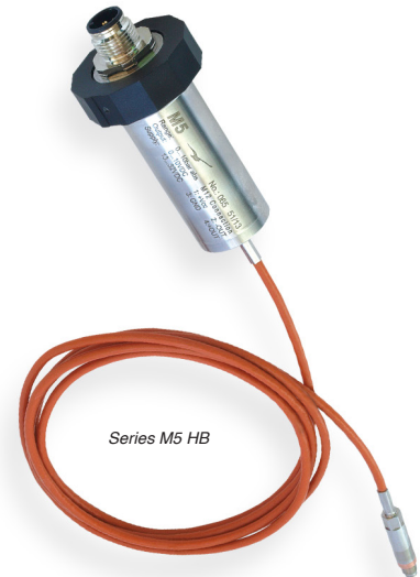
Series M5 HB